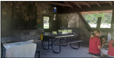
Above: Christian Weigert, summer vector surveillance program assistant, educated about thirty-five 8 to 13-year-olds about ticks and mosquitos at the Webster County 4H Day Camp at Crystal Lake on June 10.