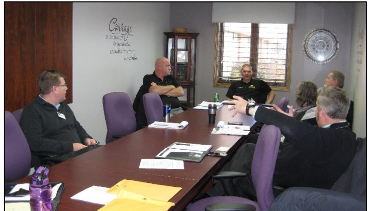
Emergency Operations Center at Good Samaritan, Hastings.