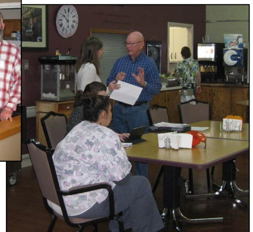
Evaluation of Dietary Department in Sutton