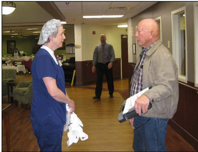
Dietary Department evaluation at Good Samaritan Society, Hastings.