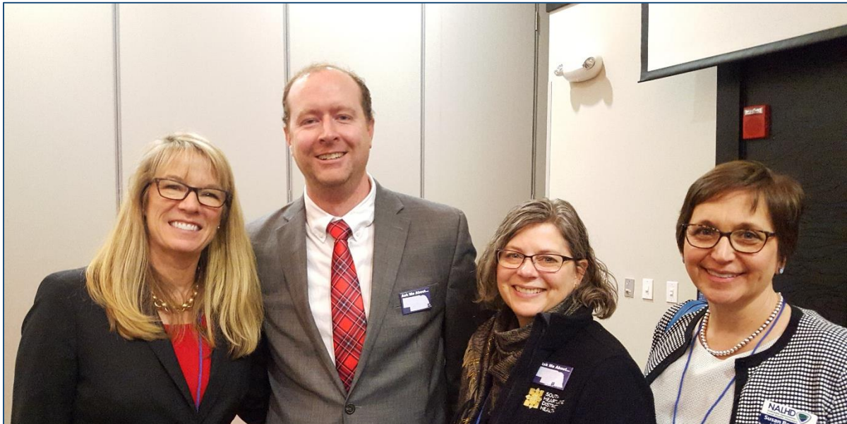
NACO Annual Meeting, December 14, 2017