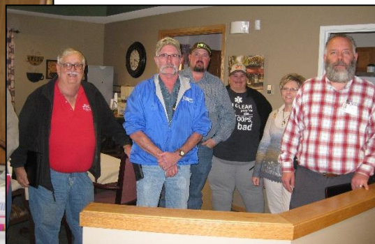
Participants and evaluators at Good Samaritan, Superior.