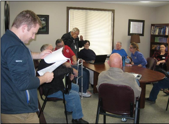
Harvard: After Action "Hot Wash" to identify what went well and areas for improvement.