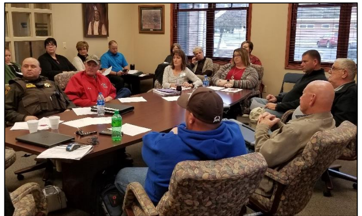
Pre-Exercise meeting in Red Cloud.