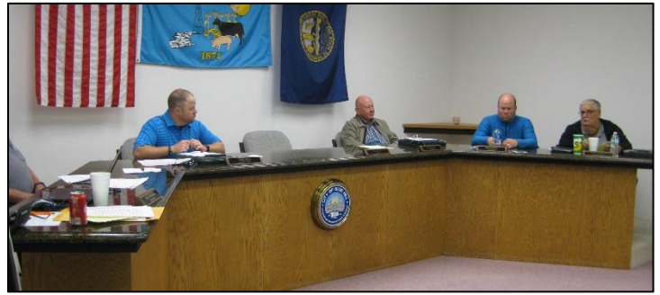
Emergency Operations Center in Blue Hill