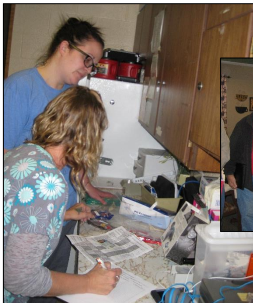
Nursing Department in action at Kenesaw.